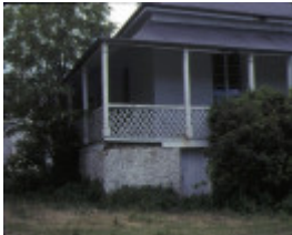
Ledcourt Homestead Stawell Verandah View May 2001