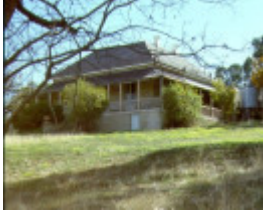
1 ledcourt homestead exterior front view may2001