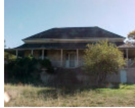
Ledcourt Exterior Entrance View May 2001