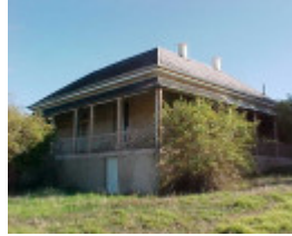
Ledcourt Exterior View May 2001