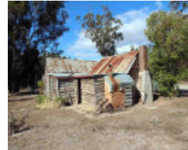
Masters House west side.jpg