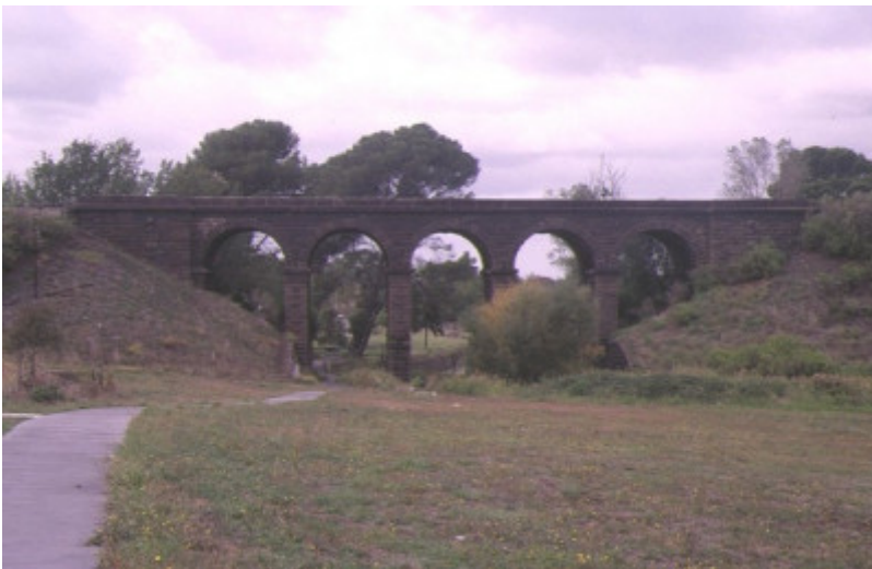
1 rail bridge over kismet creek sunbury side view jun1984