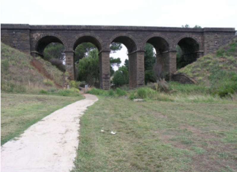
RAIL BRIDGE SOHE 2008