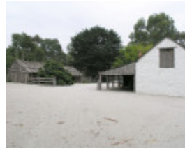
EMU BOTTOM SOHE 2008