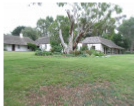
EMU BOTTOM SOHE 2008