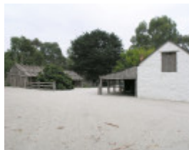
EMU BOTTOM SOHE 2008