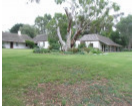
EMU BOTTOM SOHE 2008