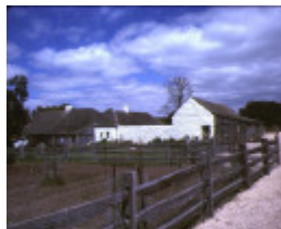
1 emu bottom racecourse road sunbury side view with fencing