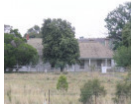
CRAIGLEE SOHE 2008