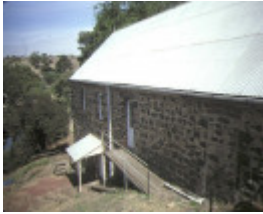
1 craiglee sunbury road sunbury side entrance mar1986