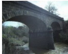
1 bridge over jackson's creek sunbury side view sep1984