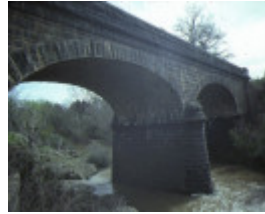
1 bridge over jackson's creek sunbury side view sep1984