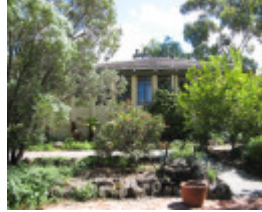
H0461 Jefferies House 18 Dec 2009 026.jpg