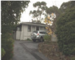
Front House June 2019