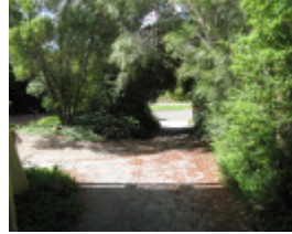
H0461 Jefferies House 18 Dec 2009 005.jpg