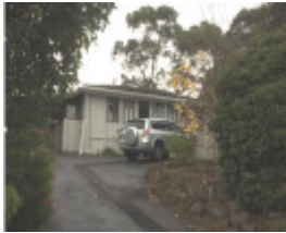
Front House June 2019