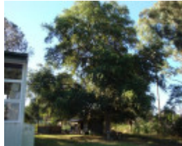
T12142 Quercus suber