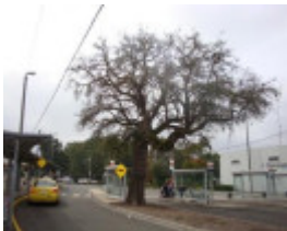
T12134 Quercus suber 2009