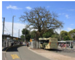
T12134 Quercus suber February 2013)