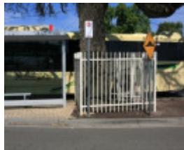
T12134 Quercus suber February 2013)