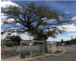
T12134 Quercus suber November 2012