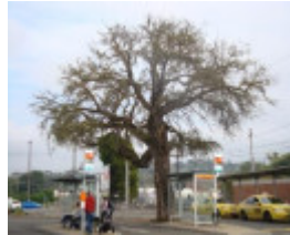
T12134 Quercus suber 2009