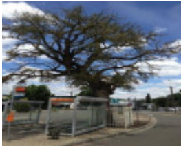
T12134 Quercus suber November 2012