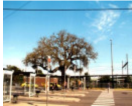
T12134 Quercus suber 2009