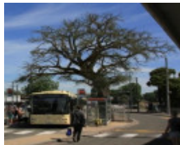
T12134 Quercus suber February 2013)