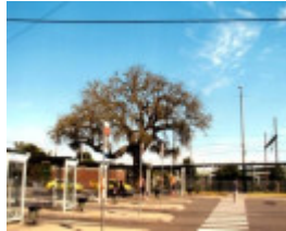
T12134 Quercus suber 2009