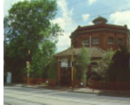
1 braille library 31-51 commercial rd sth yarra oct 2000 jbo front