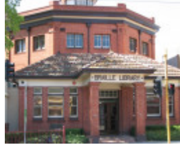
BRAILLE LIBRARY AND HALL SOHE 2008