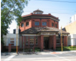
BRAILLE LIBRARY AND HALL SOHE 2008