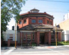
BRAILLE LIBRARY AND HALL SOHE 2008