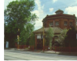
1 braille library 31-51 commercial rd sth yarra oct 2000 jbo front