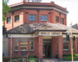
BRAILLE LIBRARY AND HALL SOHE 2008