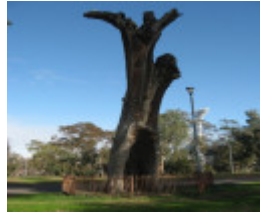
Yarra Park scarred tree 1. July 2009