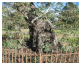
Yarra Park scarred tree 2. July 2009