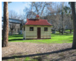
Yarra Park Cabman's shelter. July 2009