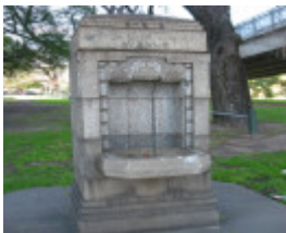
Yarra Park drinking fountain July 2009