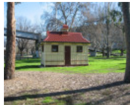
Yarra Park Cabman's shelter. July 2009