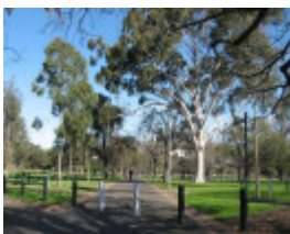
Yarra Park view from north east corner. July 2009