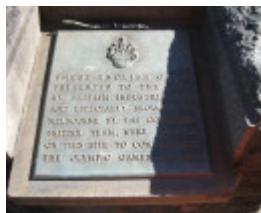
Yarra Park commemorative plaque for avenue of oaks. July 2009