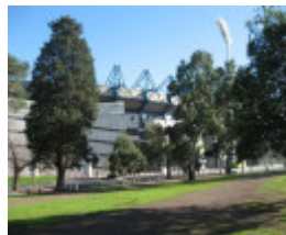
Yarra Park view towards MCG. July 2009