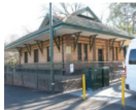
Yarra Park electrical substation July 2009