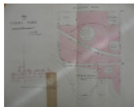
plan of Yarra Park 1867 from DSE files