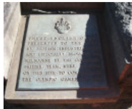
Yarra Park commemorative plaque for avenue of oaks. July 2009