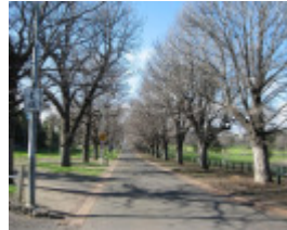
Yarra Park avenue of elms across north of site July 2009