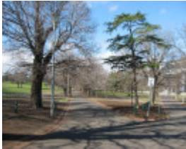
Yarra Park view towards Punt Road from north west July 2009