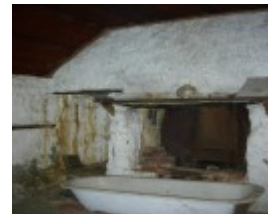
Samson residence_Bendigo_KJ_Aug 09