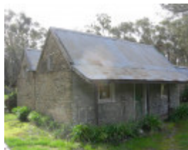
Samson residence_Bendigo_KJ_Aug 09