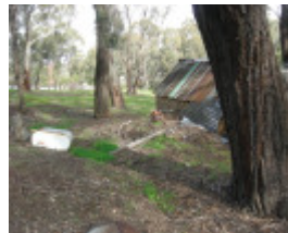
Samson residence_Bendigo_KJ_Aug 09