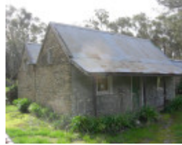
Samson residence_Bendigo_KJ_Aug 09