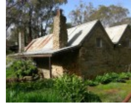
Samson residence_Bendigo_KJ_Aug 09