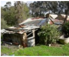
Samson residence_Bendigo_KJ_Aug 09