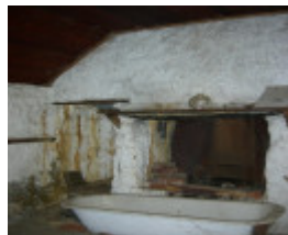
Samson residence_Bendigo_KJ_Aug 09