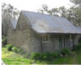
Samson residence_Bendigo_KJ_Aug 09