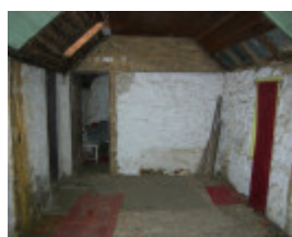
Samson residence_Bendigo_KJ_Aug 09