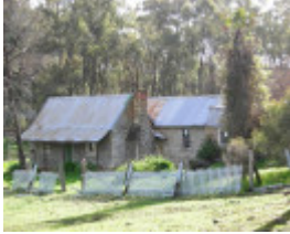
Samson residence_Bendigo_KJ_Aug 09