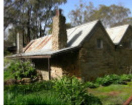
Samson residence_Bendigo_KJ_Aug 09