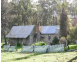
Samson residence_Bendigo_KJ_Aug 09