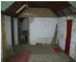
Samson residence_Bendigo_KJ_Aug 09