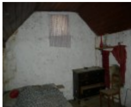
Samson residence_Bendigo_KJ_Aug 09