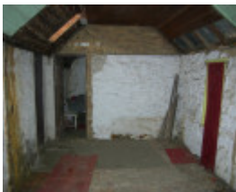
Samson residence_Bendigo_KJ_Aug 09