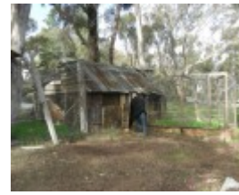
Samson residence_Bendigo_KJ_Aug 09