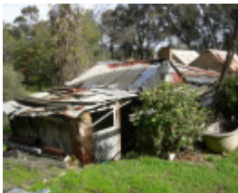
Samson residence_Bendigo_KJ_Aug 09