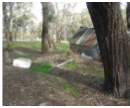
Samson residence_Bendigo_KJ_Aug 09