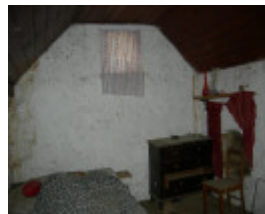
Samson residence_Bendigo_KJ_Aug 09