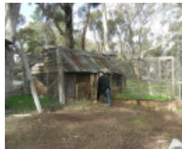
Samson residence_Bendigo_KJ_Aug 09