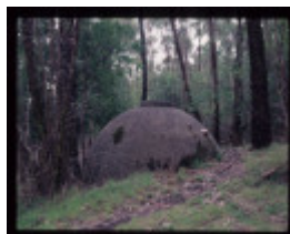
LYSTERFIELD BOYS FARM SITE EXCAVATION