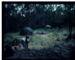
LYSTERFIELD BOYS FARM SITE EXCAVATION