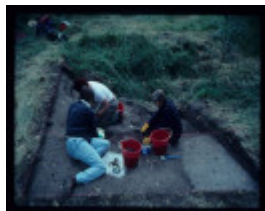
LYSTERFIELD BOYS FARM SITE EXCAVATION