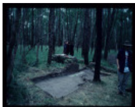
LYSTERFIELD BOYS FARM SITE EXCAVATION