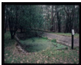
LYSTERFIELD BOYS FARM SITE EXCAVATION