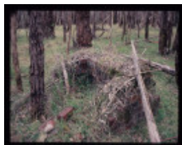
LYSTERFIELD BOYS FARM SITE EXCAVATION