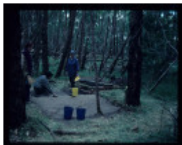
LYSTERFIELD BOYS FARM SITE EXCAVATION