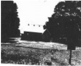
St George's Balliang Anglican Church