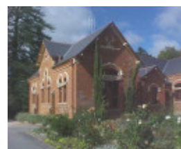
h01718 beechworth primary school junction road beechworth side detail she project 2004