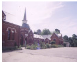
1 beechworth primary school no 1560 junction road beechworth front view mar1998