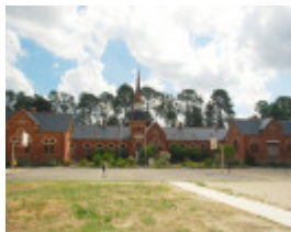
BEECHWORTH PRIMARY SCHOOL NO. 1560 SOHE 2008