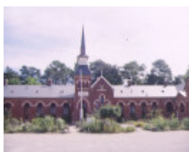
beechworth primary school no 1560 junction road beechworth front elevation mar1998