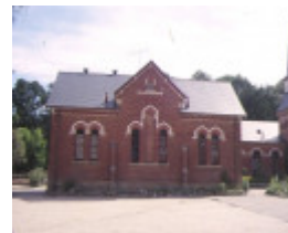
beechworth primary school no 1560 junction road beechworth front detail mar1998