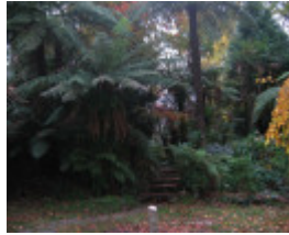
Alfred Nicholas Memorial Garden