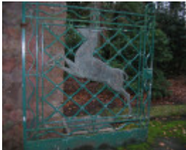
Alfred Nicholas Memorial Garden