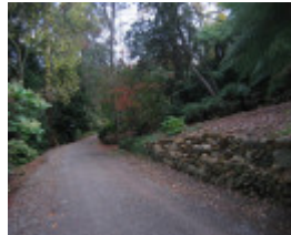
Alfred Nicholas Memorial Garden