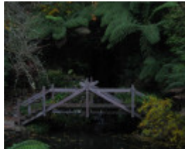
Alfred Nicholas Memorial Garden