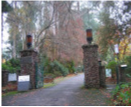
Alfred Nicholas Memorial Garden