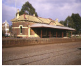
1 terang railway station terang trackside view may1995