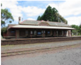
Terang RWS Station Building Platform February 2002