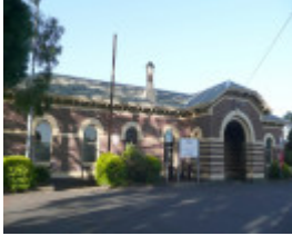
TERANG RAILWAY STATION SOHE 2008