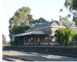
TERANG RAILWAY STATION SOHE 2008