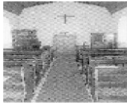
lutheran church gardenia road thomastown interior publication