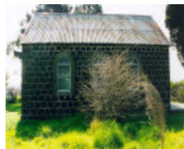
1 lutheran church gardenia road thomastown rear view