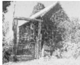
lutheran church gardenia road thomastown entrance publication