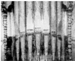
lutheran church gardenia road thomastown pipe organ detail