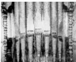
lutheran church gardenia road thomastown pipe organ detail