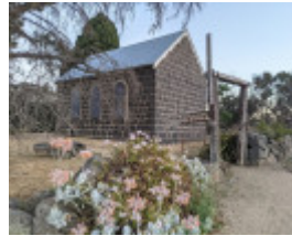
Lutheran Church 2