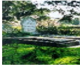
lutheran church gardenia road thomastown cemetery detail publication