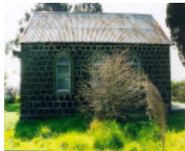
1 lutheran church gardenia road thomastown rear view