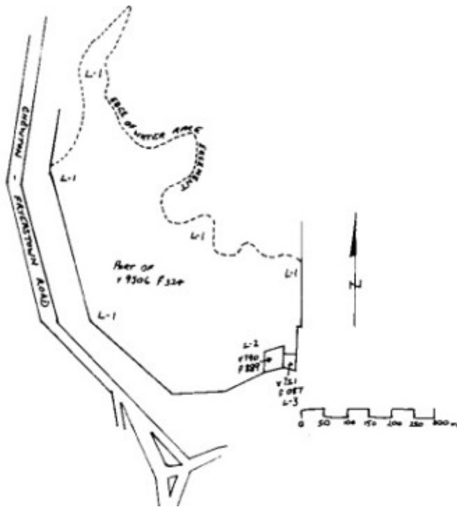
Herons Reef Tourist Mine Plan