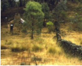
1 herons reef tourist mine wall