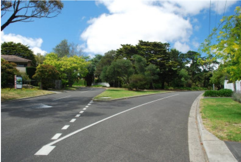
RANELAGH ESTATE SOHE 2008