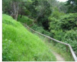
h01605 ranelagh estate mt eliza earimil walk