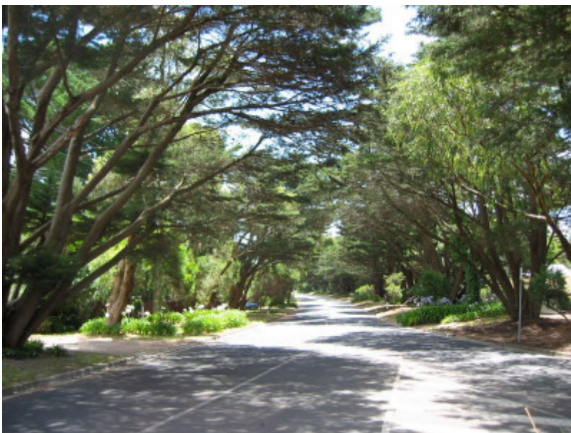
h01605 1 ranelagh estate wimbledon avenue