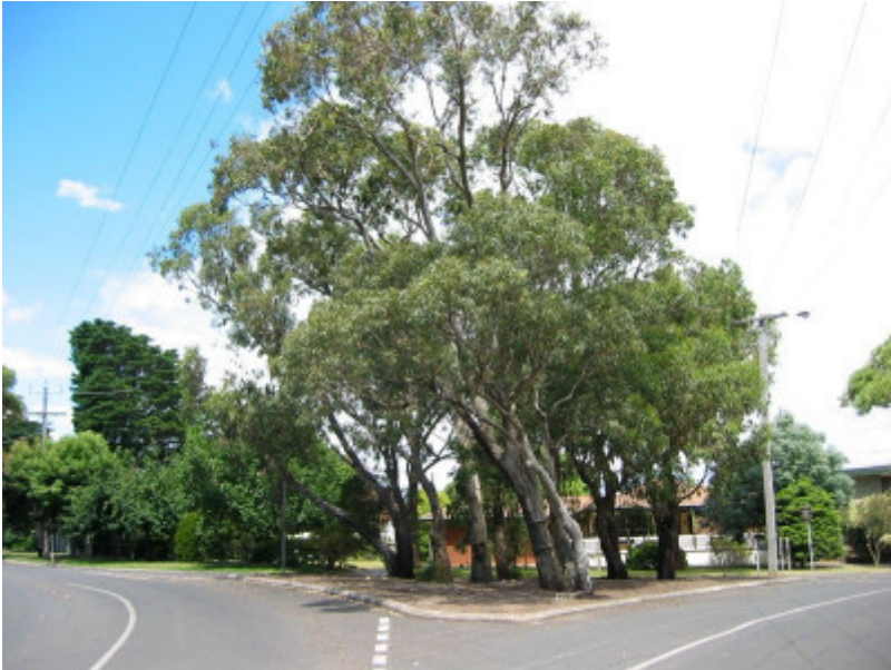
h01605 ranelagh estate traffic island