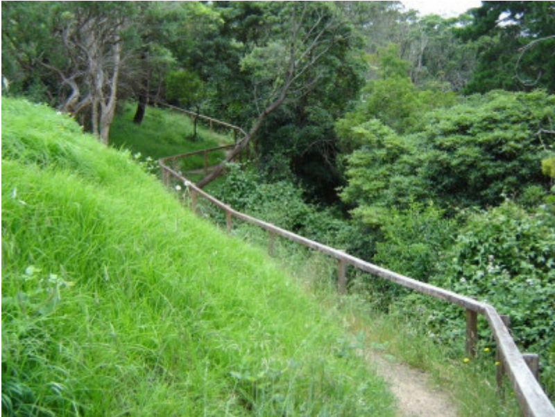
h01605 ranelagh estate mt eliza earimil walk