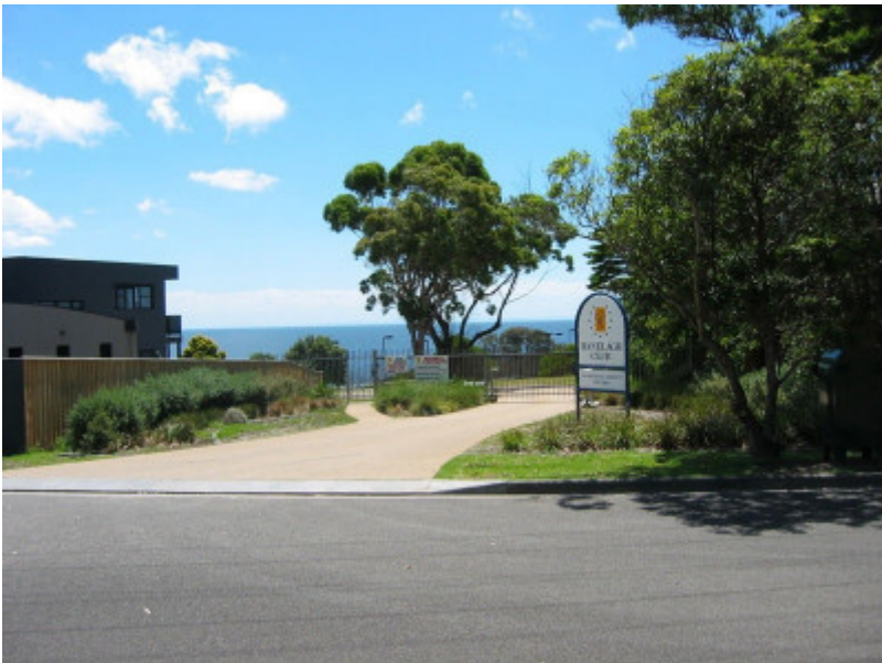
h01605 ranelagh estate ranelagh club