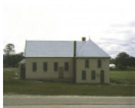
h00544 mechanics institute free library toongabbie front view aug1992