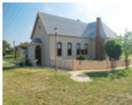
MECHANICS INSTITUTE AND FREE LIBRARY SOHE 2008