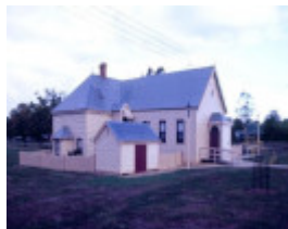
h00544 1 mechanics institute free library king and cowan street toongabbie north west view she project 2003