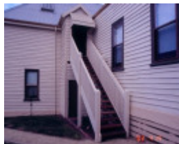
h00544 mechanics institute free library king and cowan street toongabbie exterior stair well she project 2003