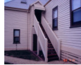
h00544 mechanics institute free library king and cowan street toongabbie exterior stair well she project 2003