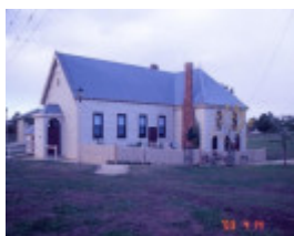
h00544 mechanics institute free library king and cowan street toongabbie south west view she project 2003