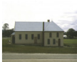
h00544 mechanics institute free library toongabbie front view aug1992