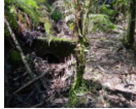
Mt Evelyn Water Supply Pipe