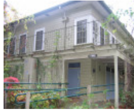
George Tindale Memorial Gardens