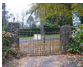
George Tindale Memorial Gardens