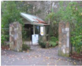
George Tindale Memorial Gardens