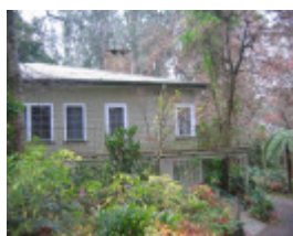
George Tindale Memorial Gardens