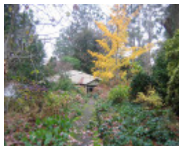
George Tindale Memorial Gardens