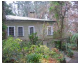
George Tindale Memorial Gardens