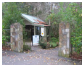
George Tindale Memorial Gardens