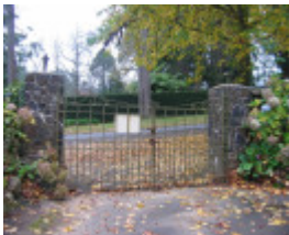
George Tindale Memorial Gardens