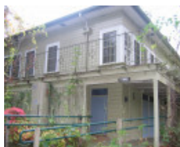
George Tindale Memorial Gardens