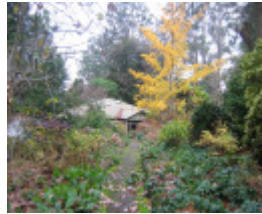
George Tindale Memorial Gardens