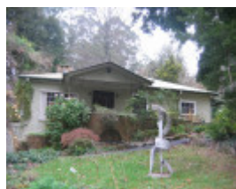
George Tindale Memorial Gardens