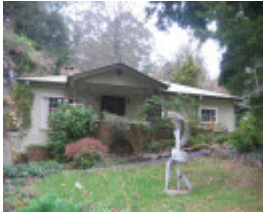
George Tindale Memorial Gardens