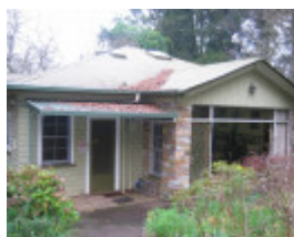
George Tindale Memorial Gardens