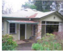
George Tindale Memorial Gardens