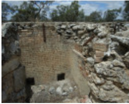
STASINOWSKY'S LIME KILN SOHE 2008