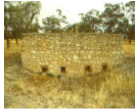
1 stasinowsky's lime kiln may 2001