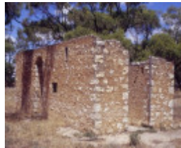
h01959 stasinowskys lime kiln chain road pella side view she project 2004