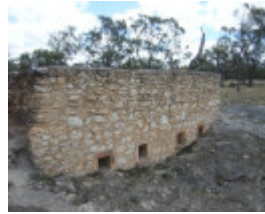
STASINOWSKY'S LIME KILN SOHE 2008