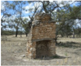
STASINOWSKY'S LIME KILN SOHE 2008