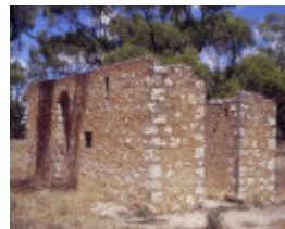
h01959 stasinowskys lime kiln chain road pella side view she project 2004