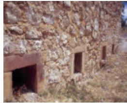
h01959 stasinowskys lime kiln chain road pella bottom of kiln she project 2004