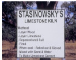
h01959 stasinowskys lime kiln chain road pella instructions she project 2004