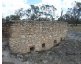
STASINOWSKY'S LIME KILN SOHE 2008