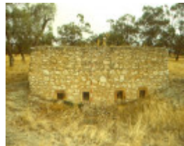
1 stasinowsky's lime kiln may 2001