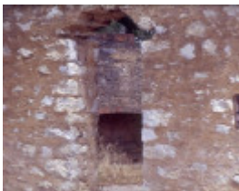
h01959 stasinowskys lime kiln chain road pella doorway she project 2004