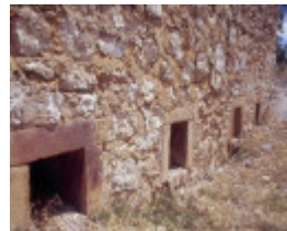
h01959 stasinowskys lime kiln chain road pella bottom of kiln she project 2004