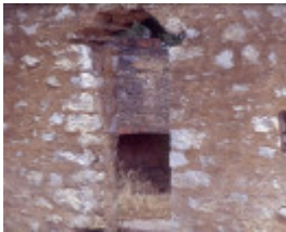
h01959 stasinowskys lime kiln chain road pella doorway she project 2004