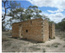
STASINOWSKY'S LIME KILN SOHE 2008