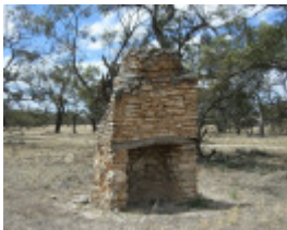
STASINOWSKY'S LIME KILN SOHE 2008