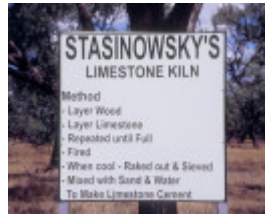
h01959 stasinowskys lime kiln chain road pella instructions she project 2004