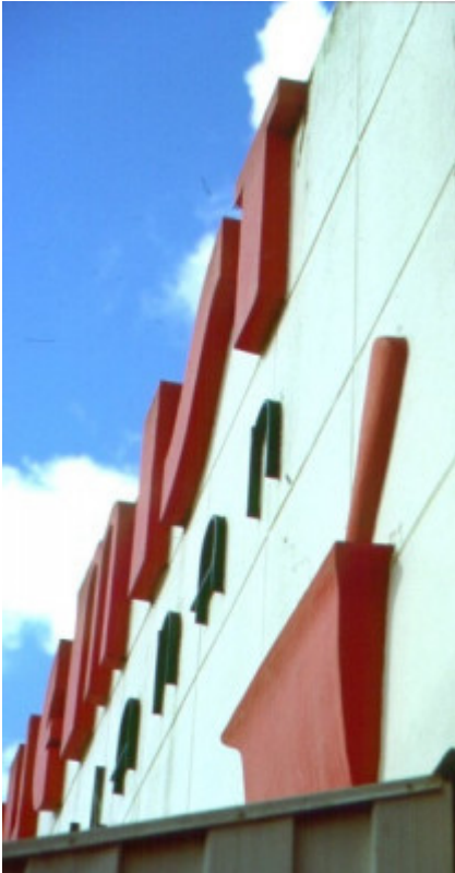
Callanans Chemist June 2001