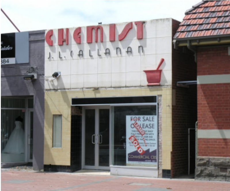
CALLANAN'S CHEMIST SOHE 2008