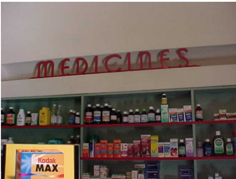
Callanans Chemist Interior Signage Medicines June 2001