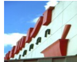
Callanans Chemist June 2001