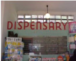
Callanans Chemist Interior Signage Dispensary June 2001