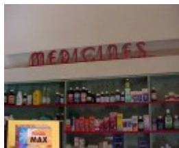
Callanans Chemist Interior Signage Medicines June 2001