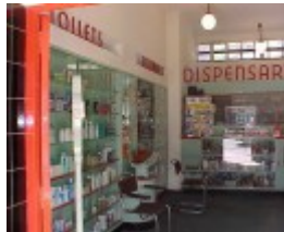
1 callanans chemist entrance interior june01