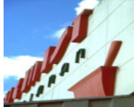
Callanans Chemist June 2001