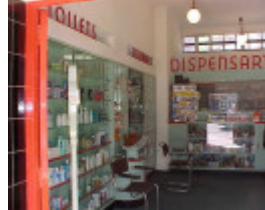
1 callanans chemist entrance interior june01