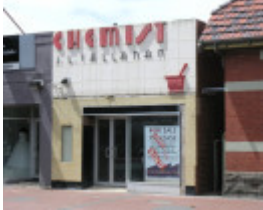
CALLANAN'S CHEMIST SOHE 2008