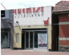
CALLANAN'S CHEMIST SOHE 2008