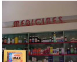
Callanans Chemist Interior Signage Medicines June 2001