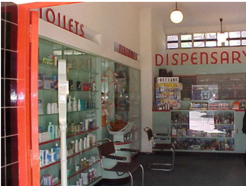
1 callanans chemist entrance interior june01