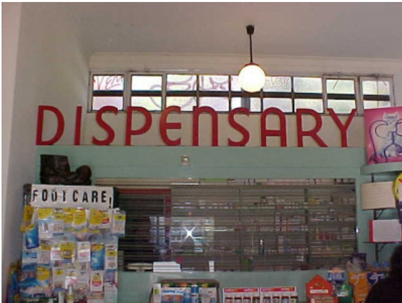
Callanans Chemist Interior Signage Dispensary June 2001