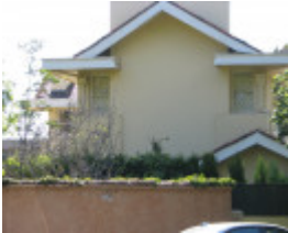
CLENDON LODGE SOHE 2008