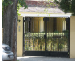
CLENDON LODGE SOHE 2008