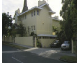
1 clendon lodge clendon rd toorak view from street feb1986