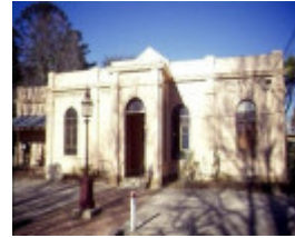
h00345 1 burke museum loch st beechworth elevation loch street she project 2003