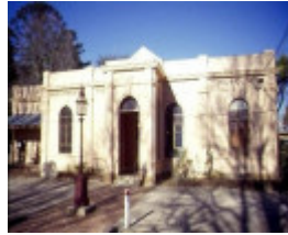
h00345 1 burke museum loch st beechworth elevation loch street she project 2003