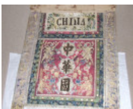
Banner- Full detail