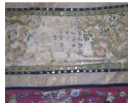
Chines banner detail 2