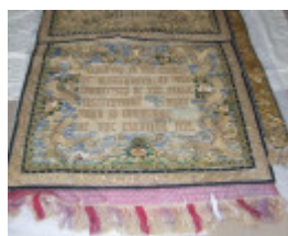
Large banner- detail