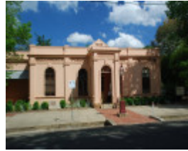
BURKE MUSEUM SOHE 2008