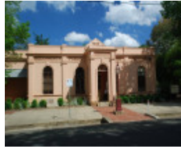
BURKE MUSEUM SOHE 2008