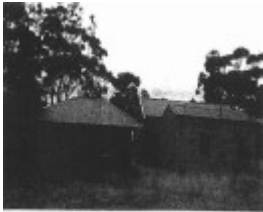
Former School & Mechanics Institute