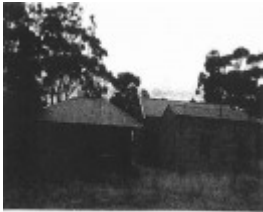
Former School & Mechanics Institute