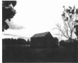
Former School & Mechanics Institute