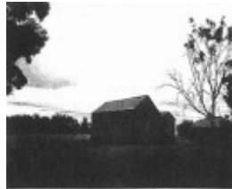
Former School & Mechanics Institute