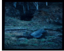
COOPERS CREEK LIME KILN 2