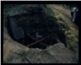
COOPERS CREEK LIME KILN 2