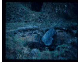
COOPERS CREEK LIME KILN 2