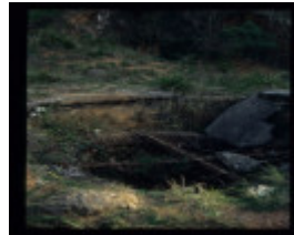
COOPERS CREEK LIME KILN 2