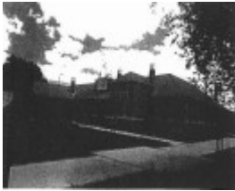
Bacchus Marsh Secondary College. Maddingley Campus