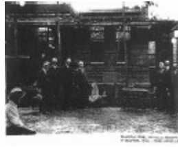
Bacchus Marsh Secondary College. Maddingley Campus