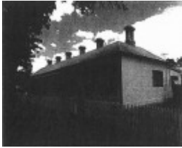
13-17 Franklin Street, Houses