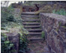
edzell st georges road toorak stone steps she project 2003