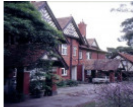
edzell st georges road toorak south facade she project 2003