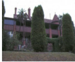
1 edzell st georges road toorak front view may1988