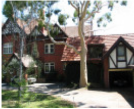
EDZELL SOHE 2008