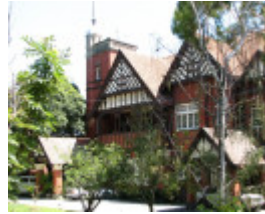
EDZELL SOHE 2008