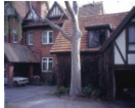
edzell st georges road toorak rear she project 2003