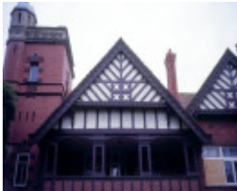
edzell st georges road toorak gable she project 2003