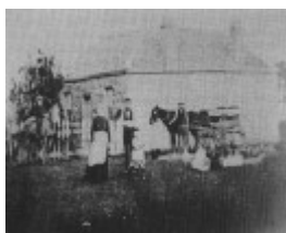
Viewbank from Venters history