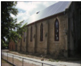
st andrews uniting church beechworth side view