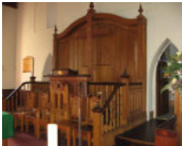
St Andrews interior