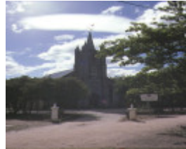
1 st andrews uniting church beechworth front view