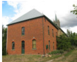
Sunday school at rear