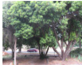
St Andrews significant trees