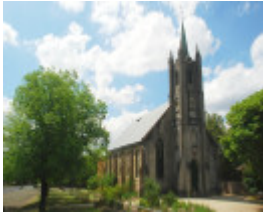
ST ANDREWS UNITING CHURCH SOHE 2008