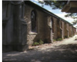
st andrews uniting church beechworth exterior church nave