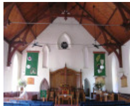
St Andrews interior