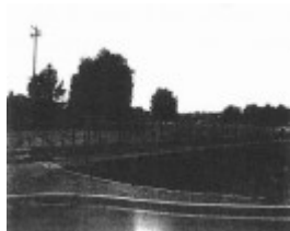
Bacchus Marsh Railway Station