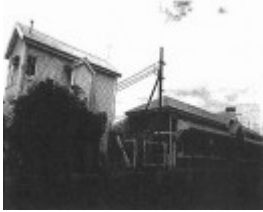
Bacchus Marsh Railway Station