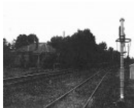
Bacchus Marsh Railway Station