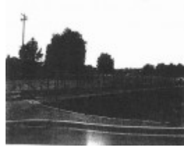
Bacchus Marsh Railway Station