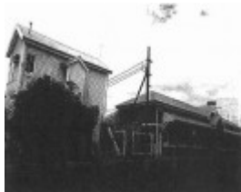
Bacchus Marsh Railway Station