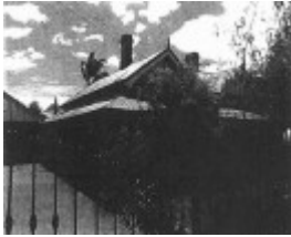
Cowan Cottage (no. 20).