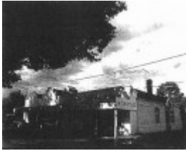
McDonalds Saddlery, Busi Fingers Ceramics Studio, Fisher & Box Pty. Ltd. Accountants