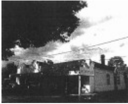
McDonalds Saddlery, Busi Fingers Ceramics Studio, Fisher & Box Pty. Ltd. Accountants