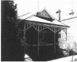
House, 48A Grant Street