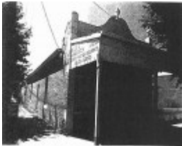
Seery & Associates Certified Practising Accountants.