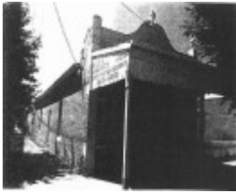
Seery & Associates Certified Practising Accountants.