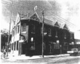
Court House Hotel