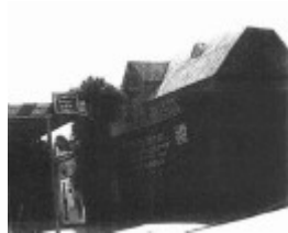
Police residence, 121 Main Street