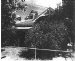
Police residence, 121 Main Street