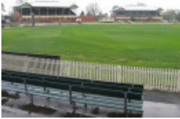
St Kilda Cricket Ground_KJ_Oct 09