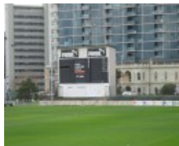
St Kilda Cricket Ground_scoreboard_KJ_Oct 09