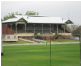
St Kilda Cricket Ground_Blackie Ironmonger Stand_KJ_Oct 09