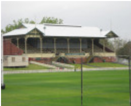
St Kilda Cricket Ground_Blackie Ironmonger Stand_KJ_Oct 09