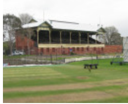
St Kilda Cricket Ground_Murray Stand_KJ_Oct 09