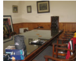
St Kilda Cricket Ground_Committee room_KJ_Oct 09