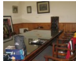
St Kilda Cricket Ground_Committee room_KJ_Oct 09