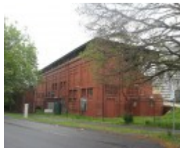
St Kilda Cricket Ground_Blackie Ironmonger rear_KJ_Oct 09