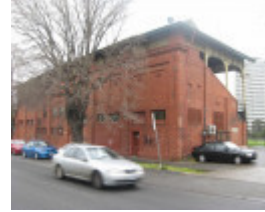
St Kilda Cricket Ground_Murray Stand rear view_KJ_Oct 09