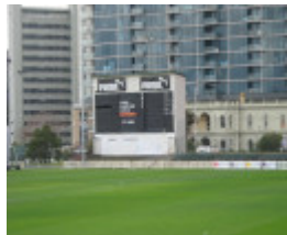
St Kilda Cricket Ground_scoreboard_KJ_Oct 09