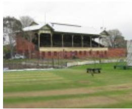
St Kilda Cricket Ground_Murray Stand_KJ_Oct 09