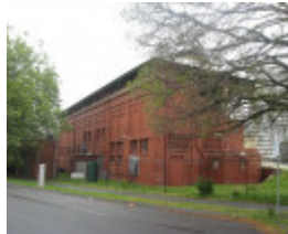
St Kilda Cricket Ground_Blackie Ironmonger rear_KJ_Oct 09