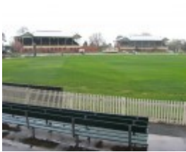
St Kilda Cricket Ground_KJ_Oct 09