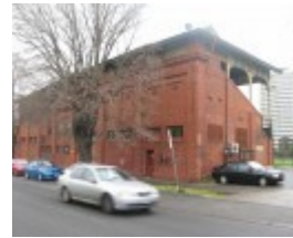
St Kilda Cricket Ground_Murray Stand rear view_KJ_Oct 09