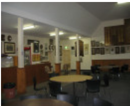
St Kilda Cricket Ground_members' bar_KJ_Oct 09