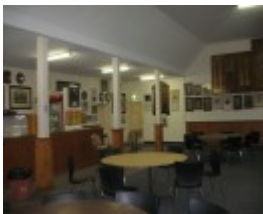
St Kilda Cricket Ground_members' bar_KJ_Oct 09