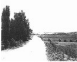
St Patrick's House. Broadlands Estate.