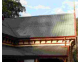
Before Photograph - Reference F3834 2014