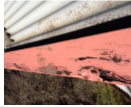
Before Photograph - Reference F3834 2014