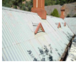
Before Photograph - Reference F3834 2014