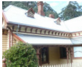
After Photograph - Reference F3834 2016