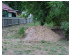
Walhalla Post Office Exterior Rear Mound March 2003