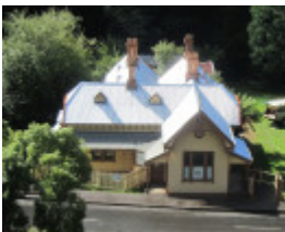
After Photograph - Reference F3834 2016