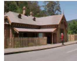
H00583 1 walhalla po exterior mar 2003