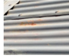
Before Photograph - Reference F3834 2014