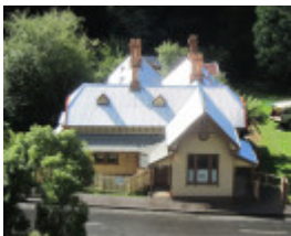
After Photograph - Reference F3834 2016