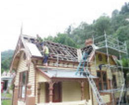
During Photograph - Reference F3834 2015