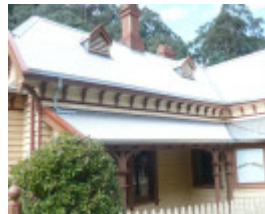
After Photograph - Reference F3834 2016