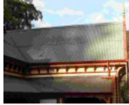
Before Photograph - Reference F3834 2014