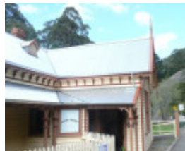
After Photograph - Reference F3834 2016