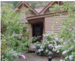
Walhalla Post Office Exterior Twin Gables March 2003