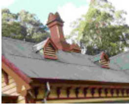
Before Photograph - Reference F3834 2014