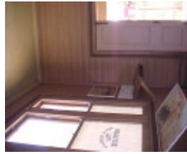
Walhalla Post Office Interior March 2003