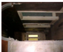
Walhalla Post Office Interior Hallway March 2003