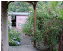
Walhalla Post Office Exterior Verandah March 2003