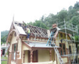
During Photograph - Reference F3834 2015