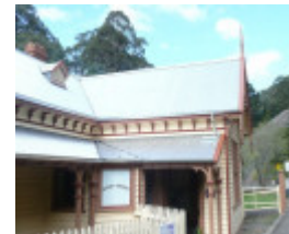
After Photograph - Reference F3834 2016