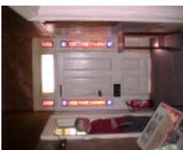
Walhalla Post Office Interior March 2003