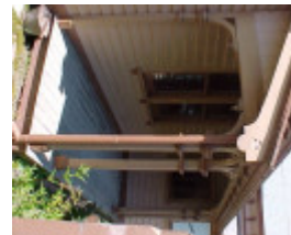
Walhalla Post Office Exterior Verandah March 2003