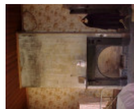
Walhalla Post Office Interior Wallpapers March 2003