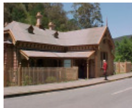
H00583 1 walhalla po exterior mar 2003