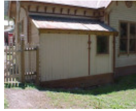
Walhalla Post Office Exterior March 2003