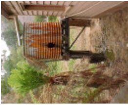
Walhalla Post Office Exterior Water Tank March 2003