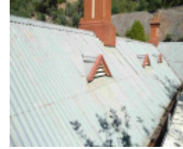
Before Photograph - Reference F3834 2014