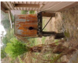
Walhalla Post Office Exterior Water Tank March 2003