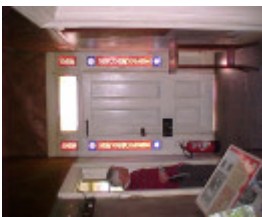
Walhalla Post Office Interior March 2003