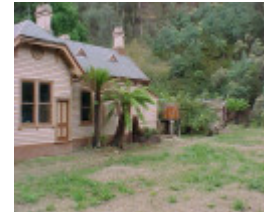
H00583 walhalla po exterior7 mar 2003