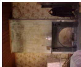
Walhalla Post Office Interior Wallpapers March 2003