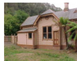
H00583 walhalla po exterior3 mar 2003