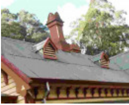
Before Photograph - Reference F3834 2014