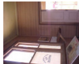
Walhalla Post Office Interior March 2003