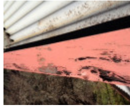
Before Photograph - Reference F3834 2014