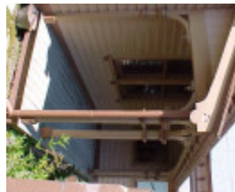
Walhalla Post Office Exterior Verandah March 2003