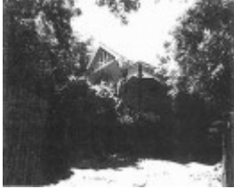
House, 90 Main Street