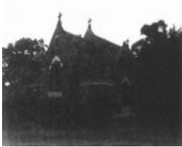
St Bernards Parish Primary School.