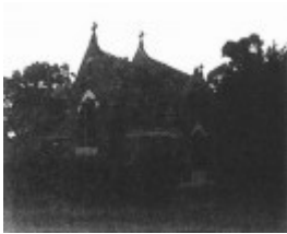
St Bernards Parish Primary School.