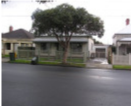
12 Waratah Street, Geelong West