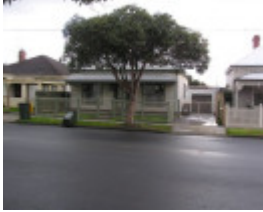
12 Waratah Street, Geelong West