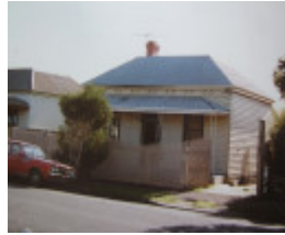
Source, Honman & Huddle, 'City of Geelong West Urban Conservation Study', 1986