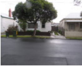
36 Warath Street, Geelong West