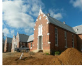
Main facade in July 2018