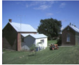
ovens & murray hospital for the aged warners road beechworth rear building