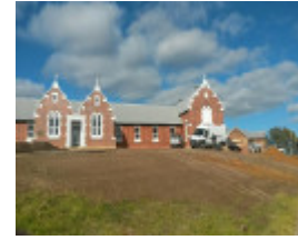
Main facade in July 2018