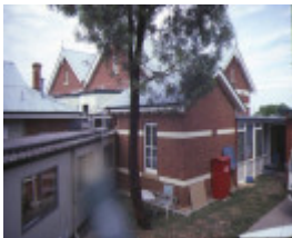
ovens & murray hospital for the aged warners road beechworth rear view dec1984