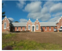
Main facade in July 2018