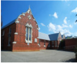
OVENS AND MURRAY HOSPITAL FOR THE AGED SOHE 2008