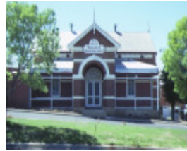
1 ovens & murray hospital for the aged warners road beechworth front view