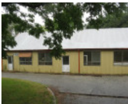
Recreation wing east side