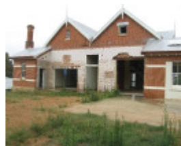
Wallace Ward rear