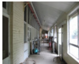
Recreation wing corridor