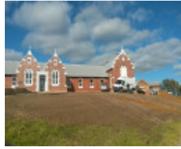
Main facade in July 2018