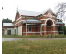
Wallace Ward front