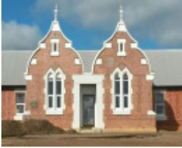
Main facade in July 2018