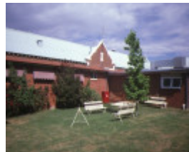
ovens & murray hospital for the aged warners road beechworth side elevation dec1984