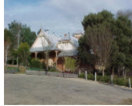
PRIMARY SCHOOL NO. 275 1 wandiligong primary school SOHE 2008 side view2 jun2001 pm1